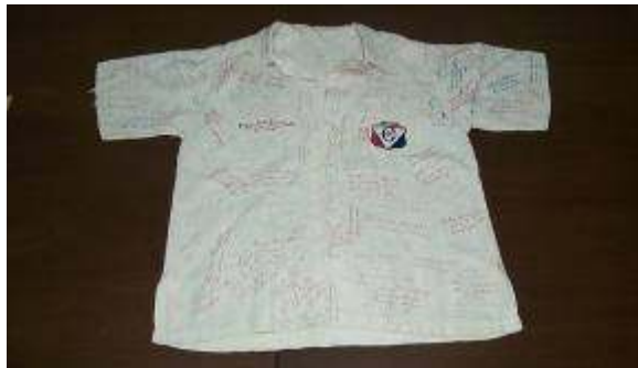
Filipino liberation shirt embroidered with 201 American soldiers names

And on microfiche, a trove of documents in Spanish and English from the early days of U. S. hegemony and many documents from World War II when U. S. citizens were interned in such locations as Los Banos and Manila's University of Santo Tomas campus.