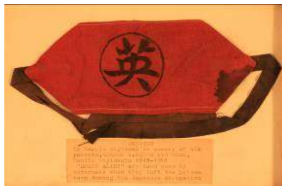
Arm band worn by internees recovered at Sto. Tomas