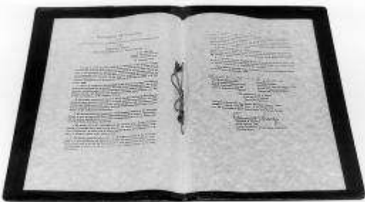
Instrument of surrender of the Japanese Armed Forces to the U. S. Army Forces

By no means do all the treasures of the American Historical Collection sit on the library's bookshelves. Many of the most interesting and poignant items are in the Special Collections: photographs, audiovisual materials microfilms, and memorabilia.